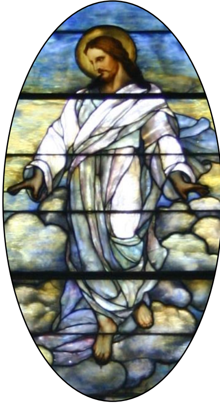
The Ascension window in the St. John's sanctuary.