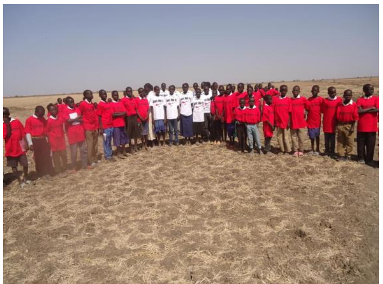
Students in South Sudan just prior to the Covid-19 Outbreak.