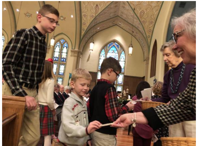
2018 Lessons and Carols—The Chrismon team passed out Chrismons to our children and youth.