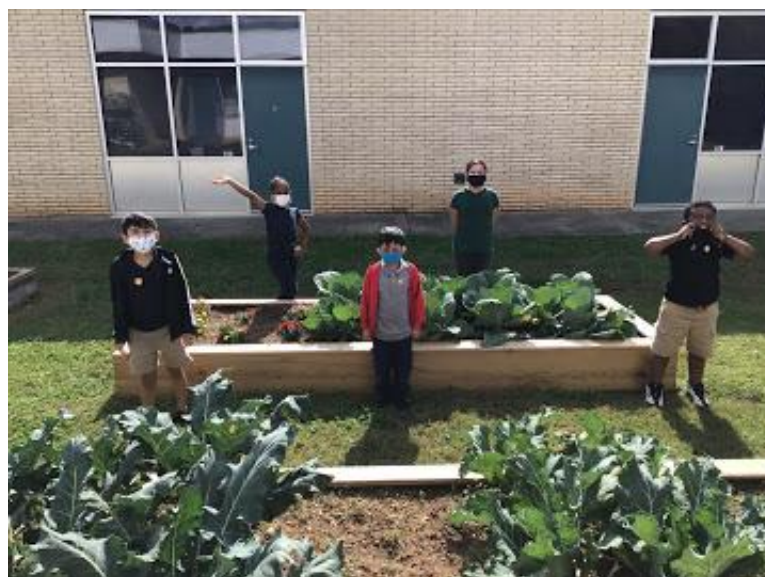
Isenberg Elementary garden