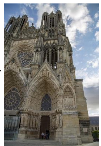
Notre Dame Cathedral, Paris

struck at how even in the face of apparent destruction a vast community stood together on the streets outside of the Cathedral singing and praying as they helplessly watched a place of comfort, worship and history being slowly devoured by flames! The haunting melody spoke of a sense of disbelief and despair over what they were witnessing – and yet at the same time a sense of hope as they remembered and sang a hymn to the lowly virgin, the mother of our Lord. Why were they singing? What was the point?