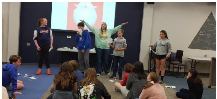
Youth Christmas Party