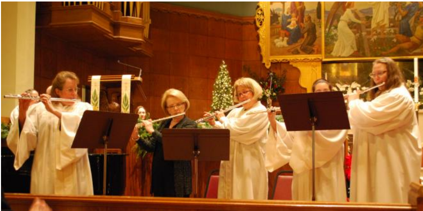
Christmas Eve at St. John's