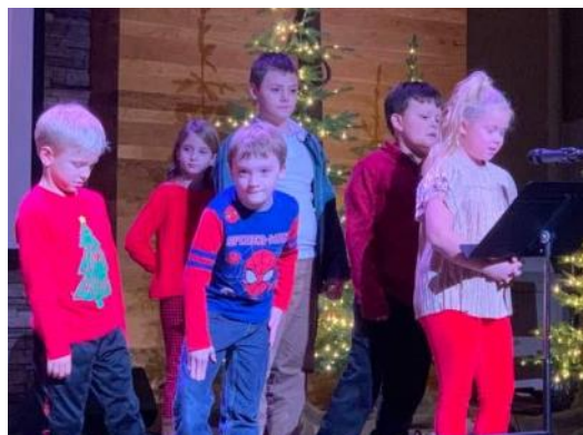
Kingdom Kids Christmas Program Kingdom Kids shared joy in their annual Christmas Program, Dec. 11, 2019.