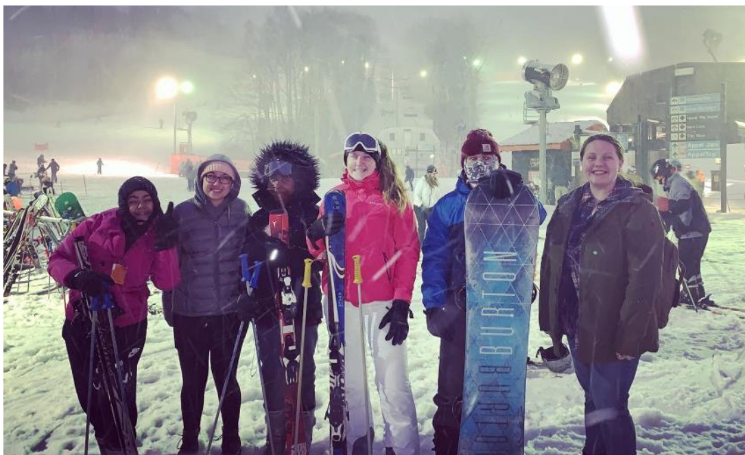
Several of our High School Youth enjoyed a Ski Trip, Jan. 3-5, Blowing Rock

Sunday, Feb. 2, 5:30-7:30 pm— Small Group Night Sunday, Feb. 9, 5:30-7:30 pm— Youth Group Sunday, Feb. 16, 5:30-7:30 pm— Youth Group Feb. 21-23—LYO Statewide Retreat