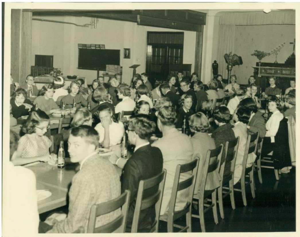
Luther League (1950s) in the Fellowship Hall. The golden eagle lectern, the 1899 Pastor's chair, and 1927 altar were located in the fellowship hall.