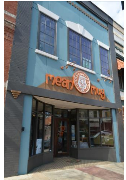
Mean Mug Coffee Co. opened at its new location, 110 N. Main St. on March 8.

"And there's a lot of good energy in the building," she says. "That's one of the things I'm enjoying most — a new beginning."