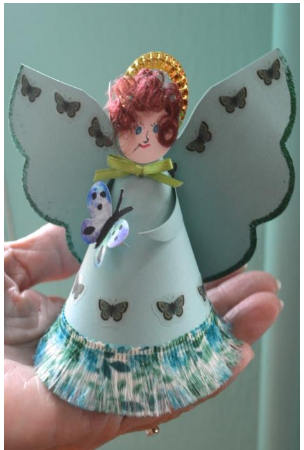
The Chrismon ladies named this one the Hula Angel!

The Chrismon Team meets from 10 am to noon each Wednesday and invites new members any time. They're also always in need of ideas for new crafts, craft supplies, and donations to buy supplies.