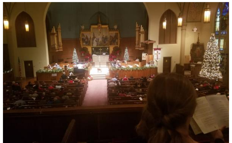
Christmas Eve Worship Services