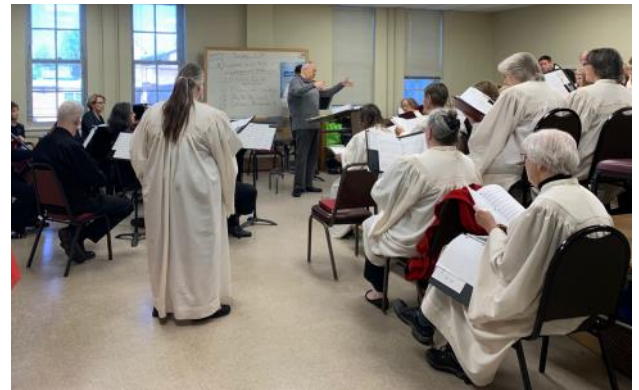
A Service of Lessons and Carols For Over 35 years, the beautiful service of Lessons and Carols has retold the story of Christmas in word and song.