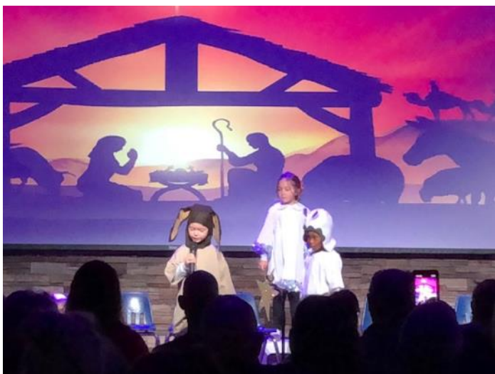
St. John's Kindergarten Christmas Program