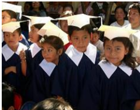
A recent graduation ceremony at la Escuela Integrada, our partner school in Antigua, Guatemala.

5. What is your involvement now with the mission?