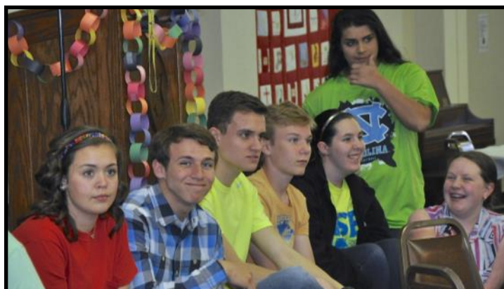
Students preparing for the Auction.