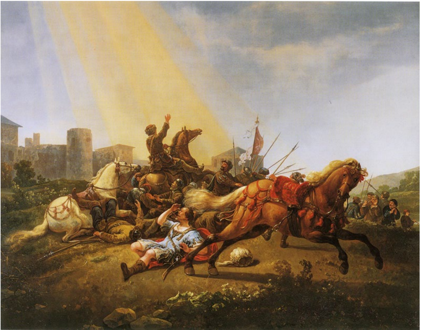
Artist: Aelbert Cuyp (1620–1691). Title: Conversion of Saul. Date: 1645.

Second Sunday of Easter April 12, 2026, 11:00 am