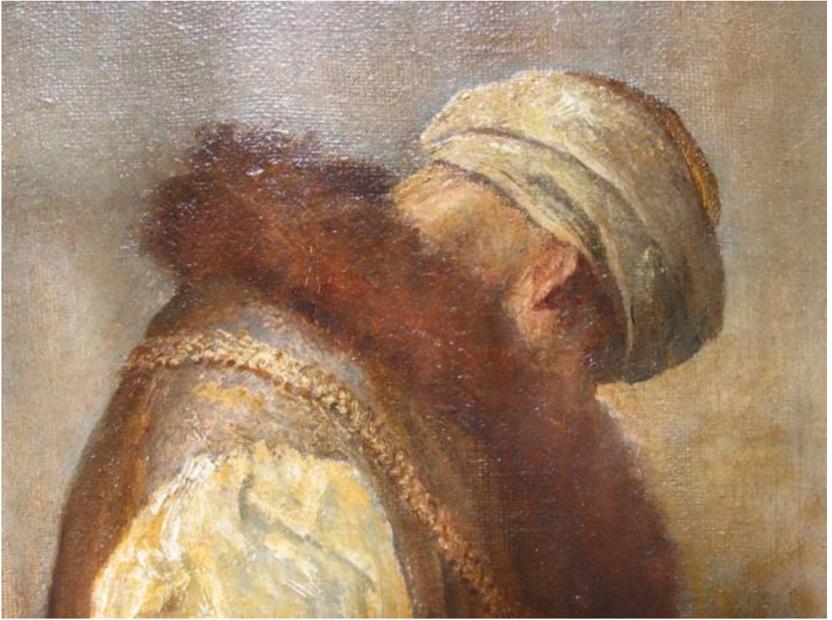
Watts, George Frederick, 1817-1904. For He Had Great Possessions, from Art in the Christian Tradition , a project of the Vanderbilt Divinity Library, Nashville, TN