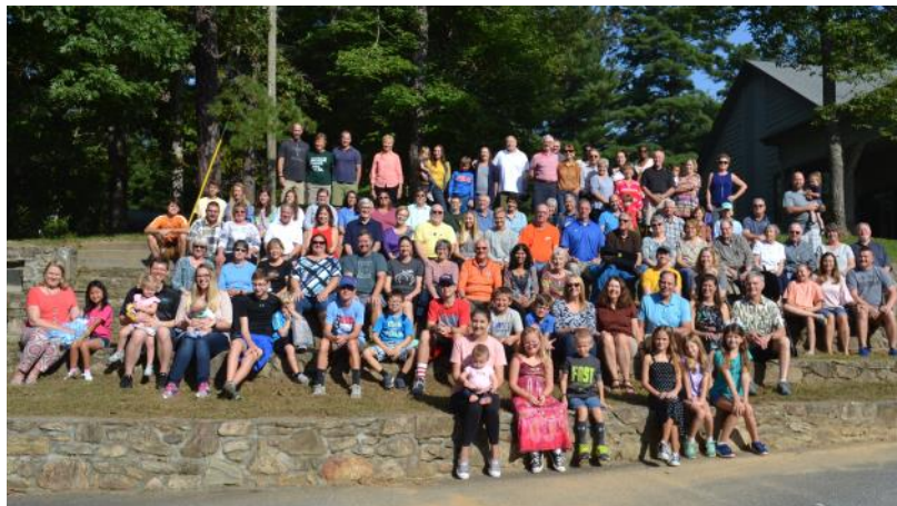
Participants gather at the end of our most recent retreat, 2018

The 1st Retreat, 2009. That first retreat was a huge success. The congregation completely took over the entire 160 acre camp. It was so cool. Over 200 participants sang, played, enjoyed hayrides, laughed-til-we-cried during the hilarious talent show, and ate in Lutheridge’s enormous dining hall.