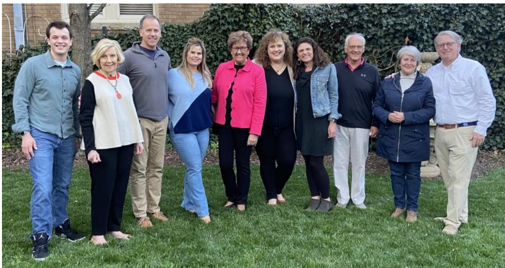
Call Committee Gathering on April 1 at the Woolly's