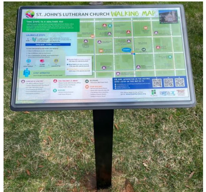
Walking Map installed on the corner of Innes and Jackson St.