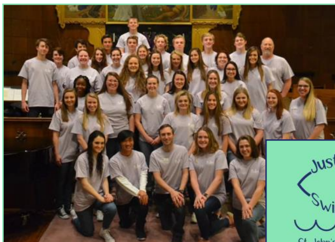
Youth Sunday 2019

Sunday, March 28, 4-5:15 pm — Youth Group Thursday, April 1, 6:30 pm — Maundy Thursday Service (Lenten Book) Friday, April 2, 6:30 pm — Good Friday Service (Lenten Book) *Sunday, April 4 — Easter Sunday NO YOUTH GROUP Sunday, April 11, 4-5:15 pm — Youth Group Wednesday, April 14, 6:30-7:15 pm — Confirmation Unit 4 — Faith Alive Makeup (ZOOM) Sunday, April 18, 4-5:15 pm — Youth Group Wednesday, April 21, 6:30-7:15 pm — Unit 4 — Faith Alive Makeup (ZOOM) Sunday, April 25, 4-5:15 pm — Youth Group Wednesday, April 28, 6:30-7:15 pm — Unit 4 — Faith Alive Makeup (ZOOM)