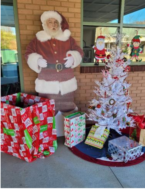
Santa & his Elves