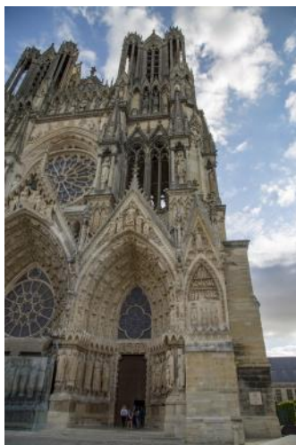
Notre Dame Cathedral, Paris

A little over a year ago on April 19, 2019 the world was stunned to hear that the Cathedral of Notre Dame in Paris was literally burning down. While this tragedy was unfolding there were many people lining the streets singing together. Many of them were singing a beautiful song Je Vous Salue Marie (Hail Mary, or Ave Maria). I watched a YouTube video( https://www.youtube.com/watch?v=iH8Pbcd4z80 ) of this and was