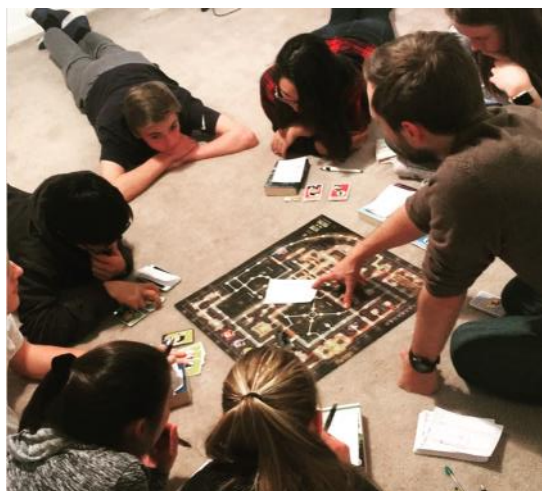
9th Grade Youth Family Dinner

Our mission is to create young disciples filled with God's love so that they can go into this world and impact their neighborhoods, friends and community.