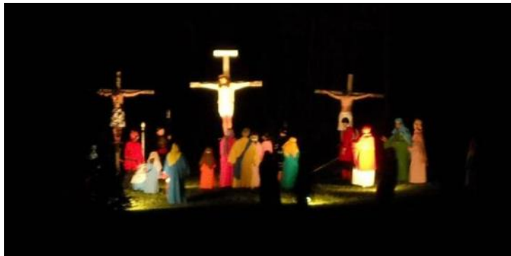
Christ's Cross and Crown at Ebenezer Lutheran Church

From a recent invitation to the church: "For the past 56 years, Ebenezer Lutheran Church has offered as a gift to our community the outdoor Easter drama, Christ's Cross and Crown , which highlights the life of Jesus Christ from his entry into Jerusalem on Palm Sunday to his resurrection on Easter Day.