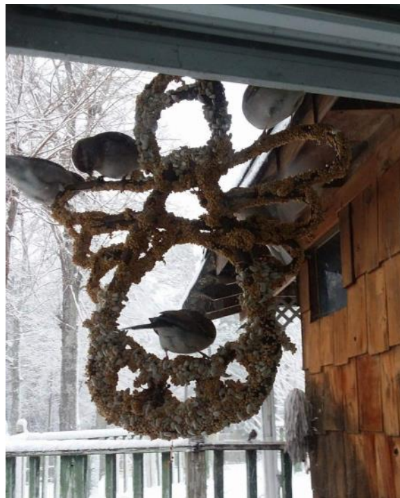
Angel bird feeder from Seasons Gifts. All proceeds from Seasons Gifts support the senior adult ministry at St. John's.