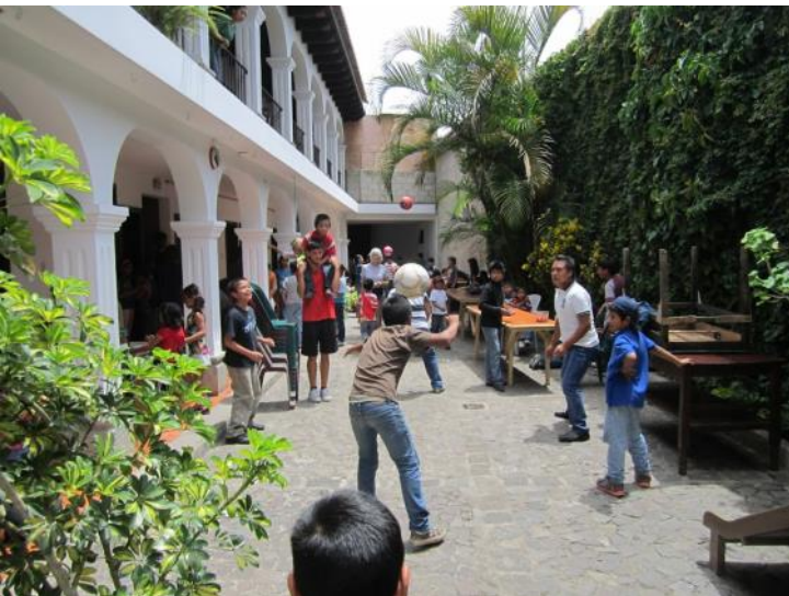
Guatemala Mission Trip 2015