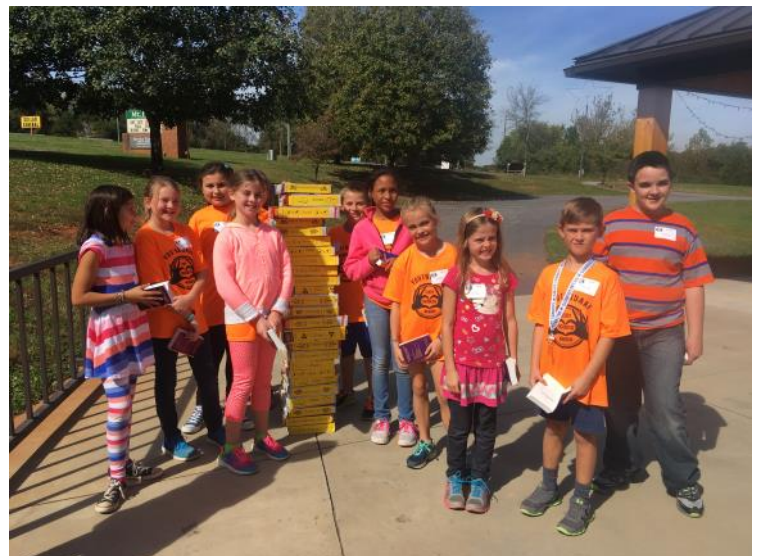
EPIC Children's Ministry